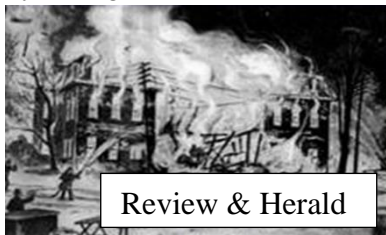
Review & Herald

Testimonies for the Church , Series B, No. 7, p. 9. How can it be said that those who were to be the voice of God to the people were not themselves listening to the voice of God? On January 2, 1903 Ellen White wrote; “My heart is filled with sorrow. For months I have had premonition of some coming disaster. I have seen what appeared to be a flaming sword of fire stretched over Battle Creek. Now a telegram has come from Battle Creek stating that the Review and Herald office has been destroyed by fire.